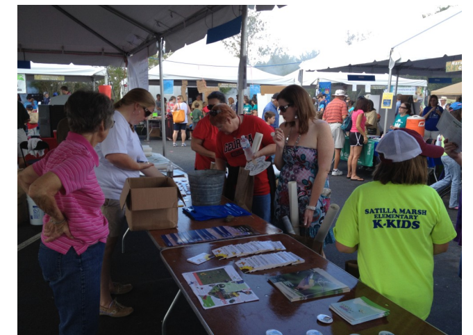
District Supervisors distribute educational materials to more than 8,000 adults and youth at CoastFest.