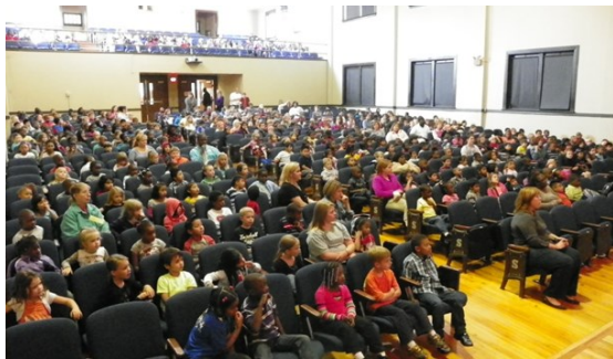
Birds of Prey Wildlife Exhibition in Cairo, GA