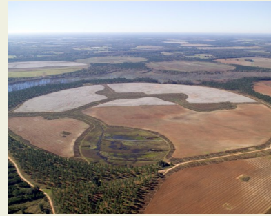
Field Utilizing Variable Rate Irrigation (VRI) technology

For 72 years, local volunteers from your communities have protected and conserved a natural resource we all depend on - the soil. The Flint River Soil and Water Conservation District presents its 2012 annual report of accomplishments to preserve the very ground we walk upon.