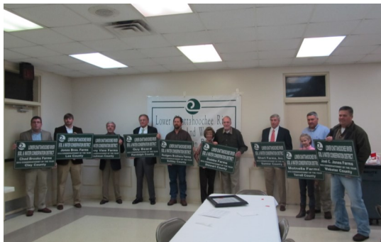
Conservationist of the Year Banquet in Dawson, GA