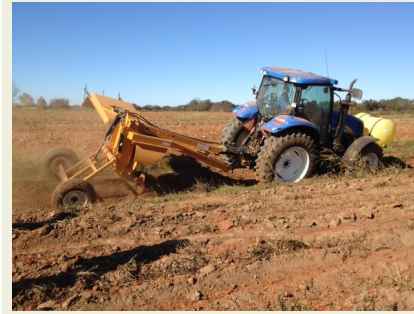
Terracing Field Day in Sumter County

For 74 years, local volunteers from your communities have protected and conserved a natural resource we all depend on - the soil. The Lower Chattahoochee River Soil and Water Conservation District presents its 2013 annual report of accomplishments to preserve the very ground we walk upon.