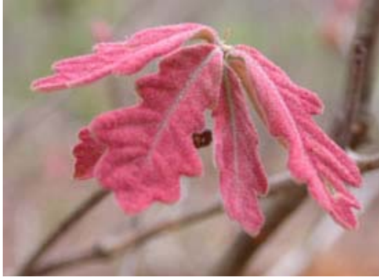
Young Oak Leaves

The Southern Forest Futures Project is a long-term research effort that collects and analyzes data to predict potential changes in southern forests between 2010 and 2060. The project will help to address contemporary issues and use computer modeling to steer land management and policy decisions concerning forests in the thirteen southern states. Phase one of the project (unveiled in May 2011) released a report that contained detailed findings of issues in forests across the South; phase two will detail implications for forest management and