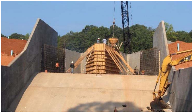
South River #4 (Madison Co.) during construction

Creek & Trail #1 in Madison County received initial upgrades; existing earthen auxiliary spillways on both structures were widened to handle a larger volume of water flow in the case of a flood event.