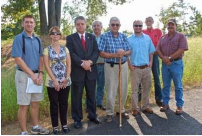
The Marion County School's walking trail design team meets to discuss future plans for the trail.

nearby community, by serving as an accessible means for exercise. The Pine Mountain SWCD hopes to incorporate natural elements in the trail so that it also serves as an outdoor learning environment. Plans have been made to plant native trees along the path and install public benches and picnic tables.