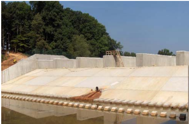
Sandy Creek #15 (Jackson Co.)

Construction is also complete on South River #4 in Madison County and Sandy Creek #15 in Jackson County. Each watershed dam received new concrete chute