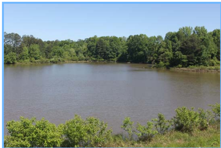
Noonday No. 16

The District partnered with the Georgia Environmental Protection Division (EPD) Safe Dam Program and Cobb County to inspect four District sponsored dams.