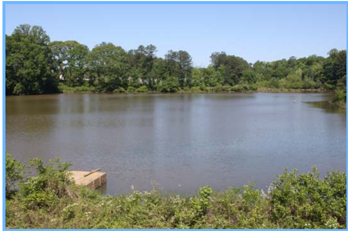
Noonday No. 16

The District partnered with the Georgia Environmental Protection Division (EPD) Safe Dam Program and Cobb County to inspect four District sponsored dams.