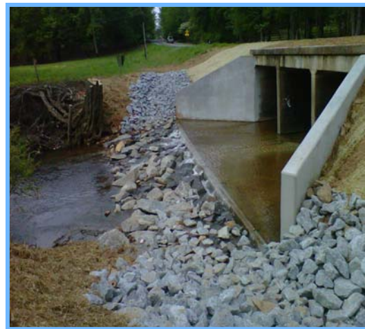
Completed debris removal at EWP site in Cobb County.

The Continuous Conservation Reserve Program, Emergency Watershed Protection Program, EQIP are NRCS programs implemented in Cobb County in recent years.