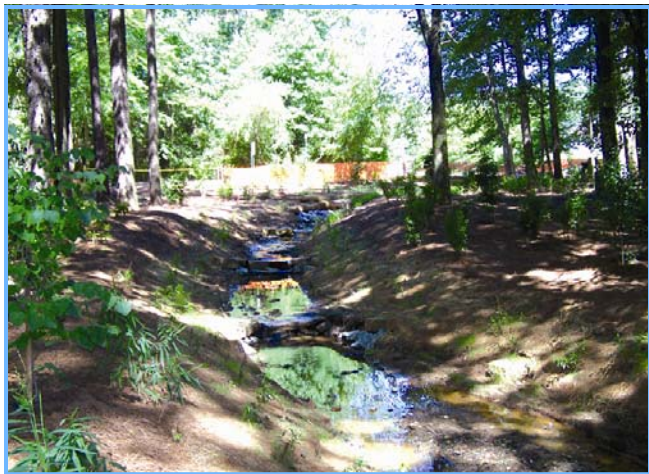
Repairs at Shaw Park