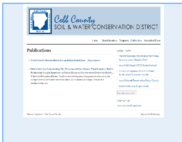
The District website can be found at www.cobbswcd.org