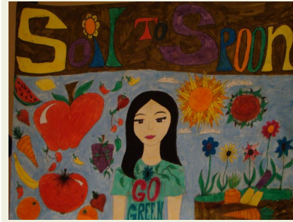
Annual Poster Contest State Winner (Berrien County)

Following the 1930s Dust Bowl disaster, Congress passed legislation declaring soil and water conservation a national policy and priority. In 1937 President Roosevelt wrote to state governors recommending legislation that would allow local landowners to form soil conservation districts.