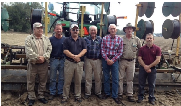
Sub-surface Irrigation Field Day