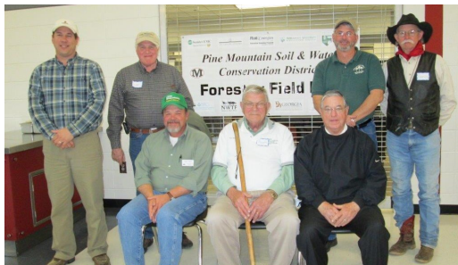
Annual Pine Mountain Forestry Field Day in Buena Vista, GA