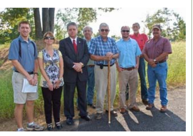
The Marion County School's walking trail design team meets to discuss future plans for the trail.

The Marion County Middle/High School walking trail is proposed as a five-year project that will be funded through grants and donations, and will be maintained in the future through a joint effort by the school's