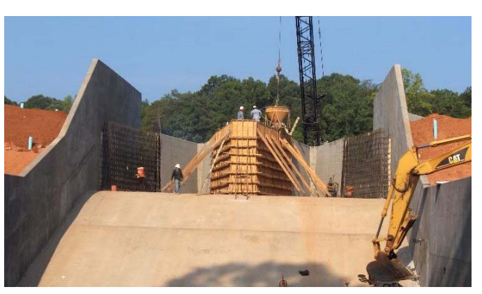
South River #4 (Madison Co.) during construction

Construction is also complete on South River #4 in Madison County and Sandy Creek #15 in Jackson County. Each watershed dam received new concrete chute