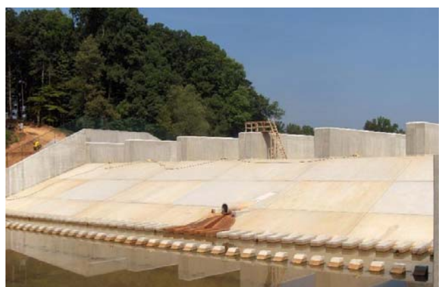
Sandy Creek #15 (Jackson Co.)

spillways with labyrinth weirs. Earthen auxiliary spillways were closed on each dam and the height was increased by three to four feet.