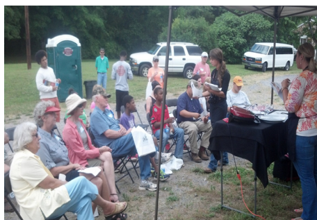
Beef Board offers a cooking demo at Oakdale Farms Field Day

All ages were welcomed and attendees as young as 15 months were able to participate in the kids' garden tour. A hamburger lunch was provided by the Floyd County Cattlemen's Association. Rolling Hills RC&D and Floyd County Farm Bureau also provided food and drinks throughout the day. Additional sponsors included the Georgia Grazing Lands Conservation Coalition and Two Rivers RC&D.