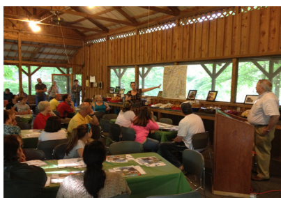
Catoosa County SWCD hosts picnic celebrating NACD poster contestants

A Poster Contest Awards Picnic was hosted by the Catoosa County SWCD at the Elsie Holmes Nature Center to thank students who had prepared posters on the National Association of Conservation Districts' 2013 theme of "Where does your water shed?" District supervisors were impressed with the level of education the students had about watersheds.