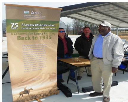
Natural Resources Conservation Service talks about its history of conservation