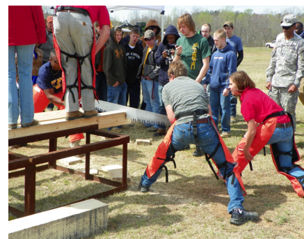
Students compete for the fastest time in team sawing competition