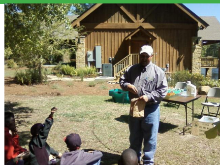
Students participate in outside learning activity at Gully Branch Tree Farm