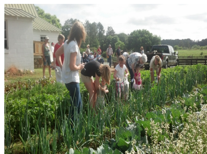
Children learn about the joys of gardening during Field Day outing