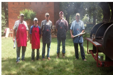
Floyd County Cattlemen's Association provide lunch