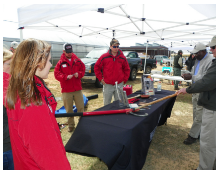
Attendees examine hand tools needed for forestry work in Georgia

The Pine Mountain SWCD also sponsored a Farmer's Field Day as part of a cooperative grant agreement with the Georgia Association of Conservation District Supervisors (GACDS). The day was designed to increase educational opportunities to historically underserved agricultural producers in the district.