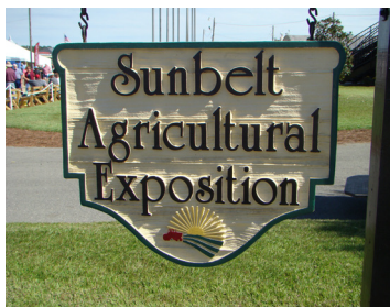
2013 Sunbelt Ag Expo hosted more than 90,000 visitors over three days in Moultrie, Ga.