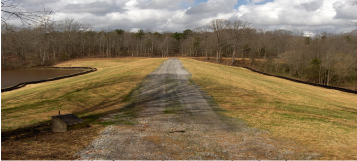
Example of a properly maintained earthen dam.