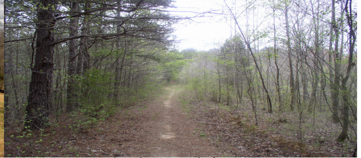
An earthen dam in need of maintenance.

Georgia is home to 357 watershed dams built to provide flood protection. While much of this protection was originally meant to protect agricultural land, over time the increase in downstream development means that a number of these dams now protect roads and bridges, commercial development, and residential development.