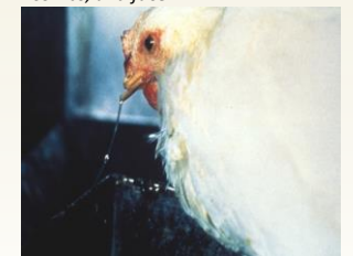
Nasal discharge (a runny nose) can be a sign of HPAI.