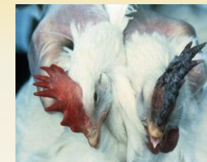
Purple discoloration of the comb could indicate HPAI.