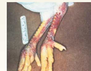
Hemorrhaging of the skin and legs is just one of the signs birds might exhibit when infected with the HPAI virus.