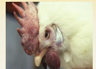
Birds affected by HPAI could show swelling of the head, wattles, combs, and face.