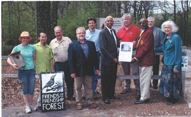
Congressman Hank Johnson with members of the Friends of Friendship Forest, DeKalb District Supervisors, GSWCC staff, and Clarkston officials.

The City of Clarkston's Friendship Forest was recently awarded a $10,000 federal grant administered through GSWCC to restore wildlife habitat. The funds came from the US Fish and Wildlife Service through their Partners for Fish and Wildlife Program to assist in the protection of habitat types that conserve or restore native vegetation, hydrology, and soils associated with imperiled ecosystems. The largely urban area of Clarkston, just east of Atlanta, provided an ideal setting to display conservation and education practices for the